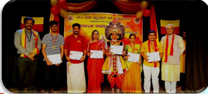
Ganesha Festival at MPBIM