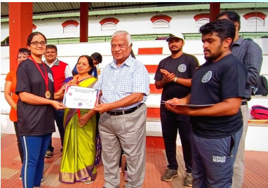
Chairman gives away prizes after the MPBIM Birla Cricket League 2022