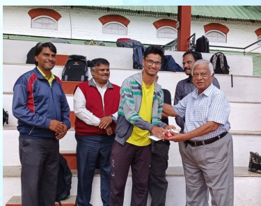
Chairman felicitates umpires after the Birla Cricket League 2022